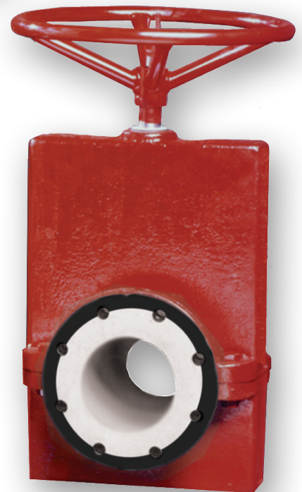
▲ NSF 61 Certified Pinch Valve

For more information and specifications, contact Red Valve at 412.279.0044 or visit us on the web at www.redvalve.com .